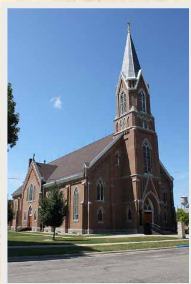
St. Joseph - Granville

A proud part of the tradition and growth of the Le Mars, Alton, Granville, and Hospers areas, plus the Sioux City Diocese, Gehlen Catholic continues to serve the Lord and His People by providing an outstanding Catholic education.