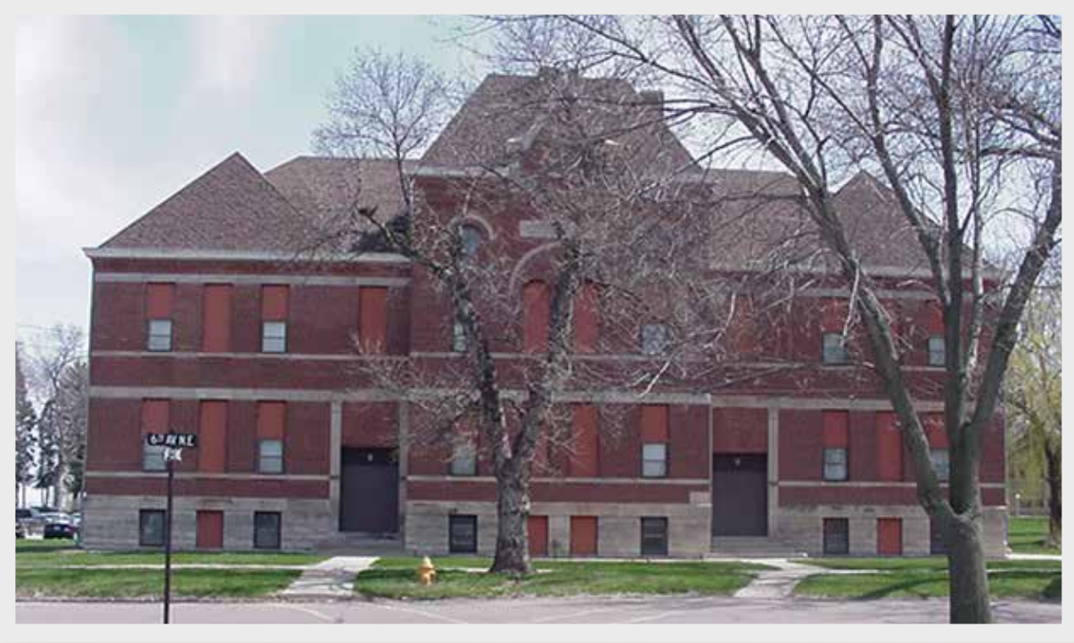
Old St. Joseph School