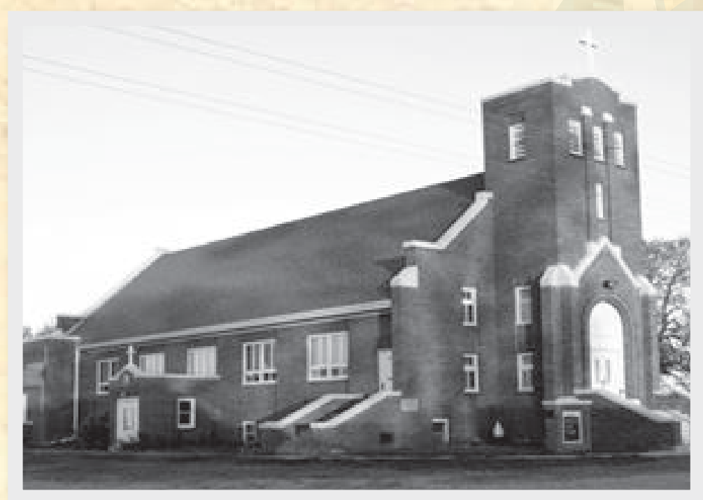
St. Joseph - Ellendale