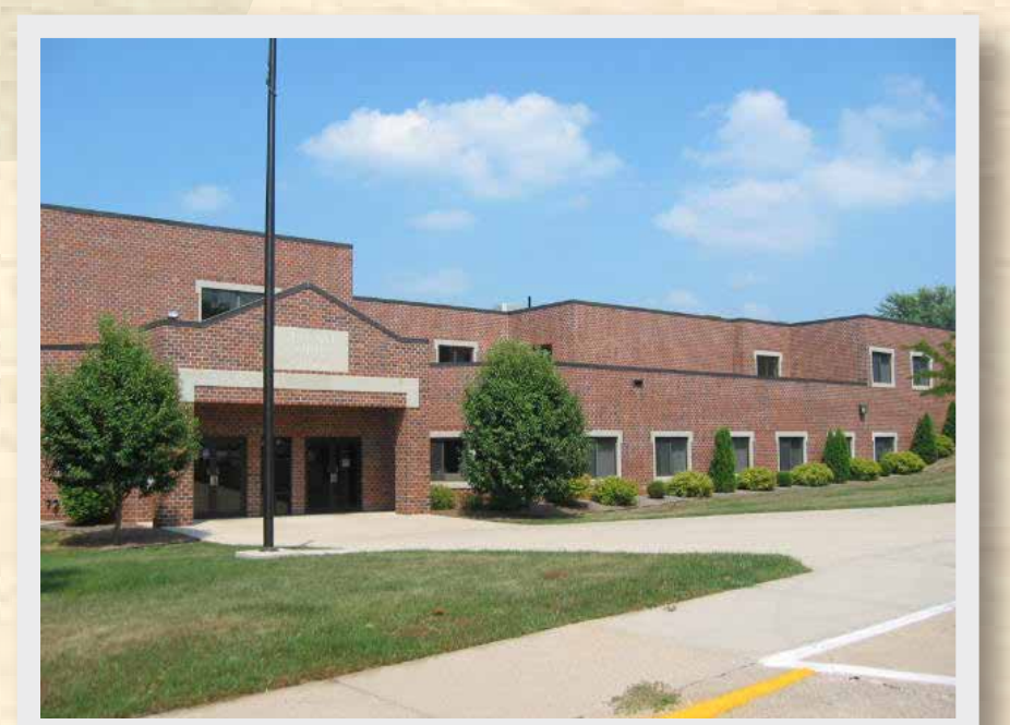
Gehlen Catholic School