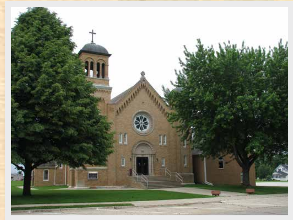
St. Anthony - Hospers