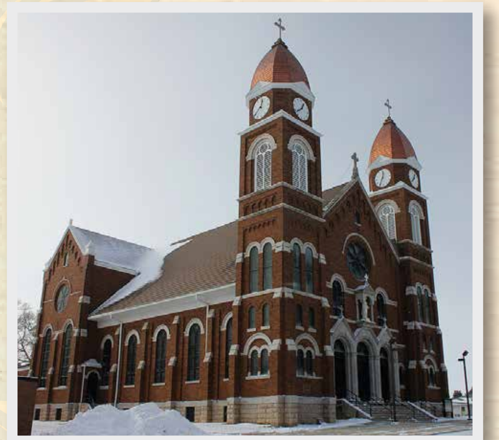
St. Mary's - Alton

In July 2008, the old St. Joseph School was razed. A memorial was designed using the bricks from the old school to create a lasting tribute to St. Joseph School between the new church and school.