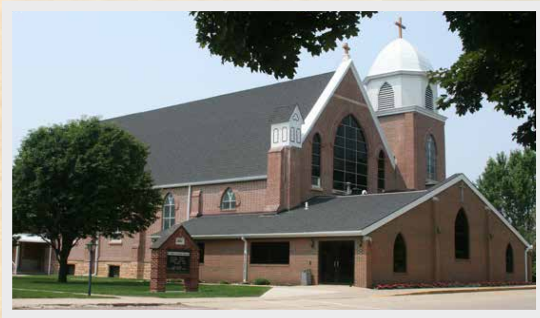
St. James - Le Mars

In 1961, a successful fund drive resulted in the construction of a new multi-purpose room and a complete remodeling of the high school building.